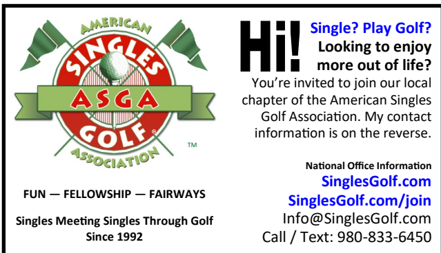
Front side of business card

25 Business Cards Will Be Mailed to You Upon Request!