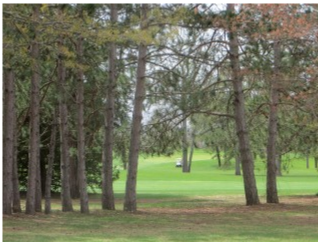
After golf the crew gathered at The Parlor at nearby Schenectady Muni.