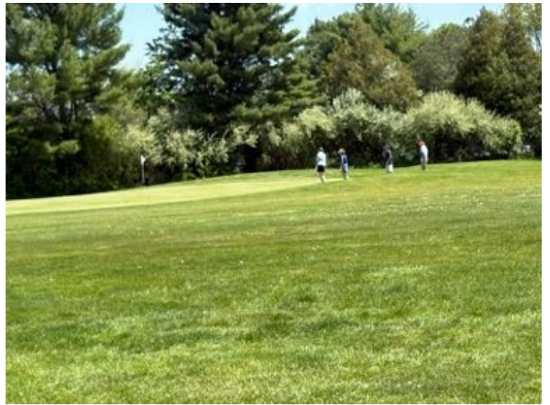
Whoops, that 6 iron didn't go as planned...