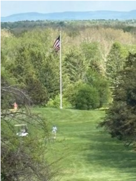
After golf, dinner and prizes in the Sycamore clubhouse...